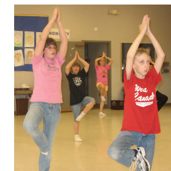
West Canada Valley students take part in their Tai Chi Class conducted by instructors from Tai Chi-Hupkwondo International.